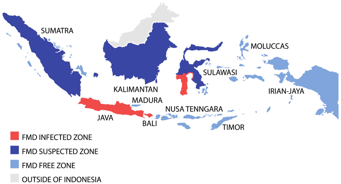
Figure 2. Map demonstrating the progressive vaccination zones use during the Indonesian FMD eradication campaign. Adapted from Soehadji et al.[61]