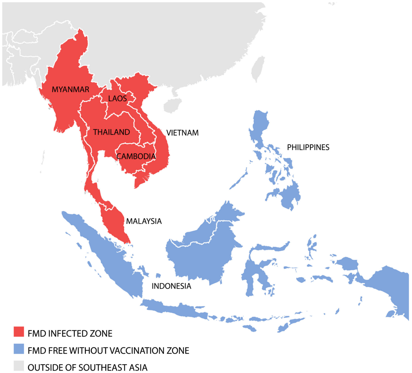
Figure 1. Map of SEA indicating FMD disease status