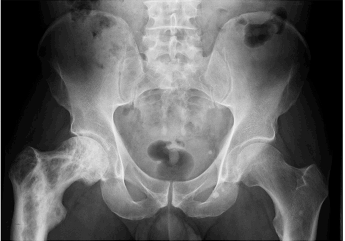
Figure 1. X-ray features of PDB

Pelvic radiograph from a patient with PDB affecting the upper right femur showing alternating areas of osteolysis and osteosclerosis in the greater and lesser trochanters and femoral neck; loss of distinction between the cortex and medulla in the upper femur; bone expansion and deformity of the affected femur; and a pseudofracture on the lateral aspect of the femur opposite the lesser trochanter.