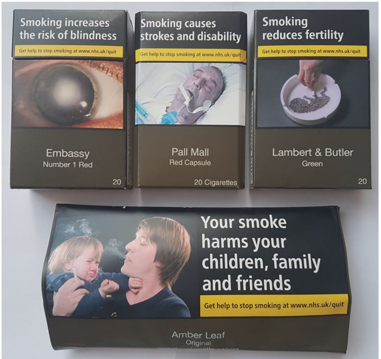
Figure 1. Standardised packs used in the survey.