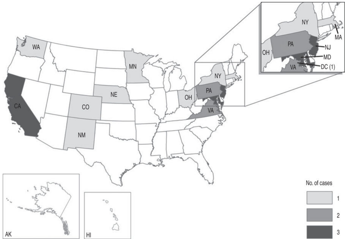
Fig. 2. Persons infected with the outbreak-associated strain of Listeria monocytogenes by state of residence ( n = 22 ), United States, March–October 2012.