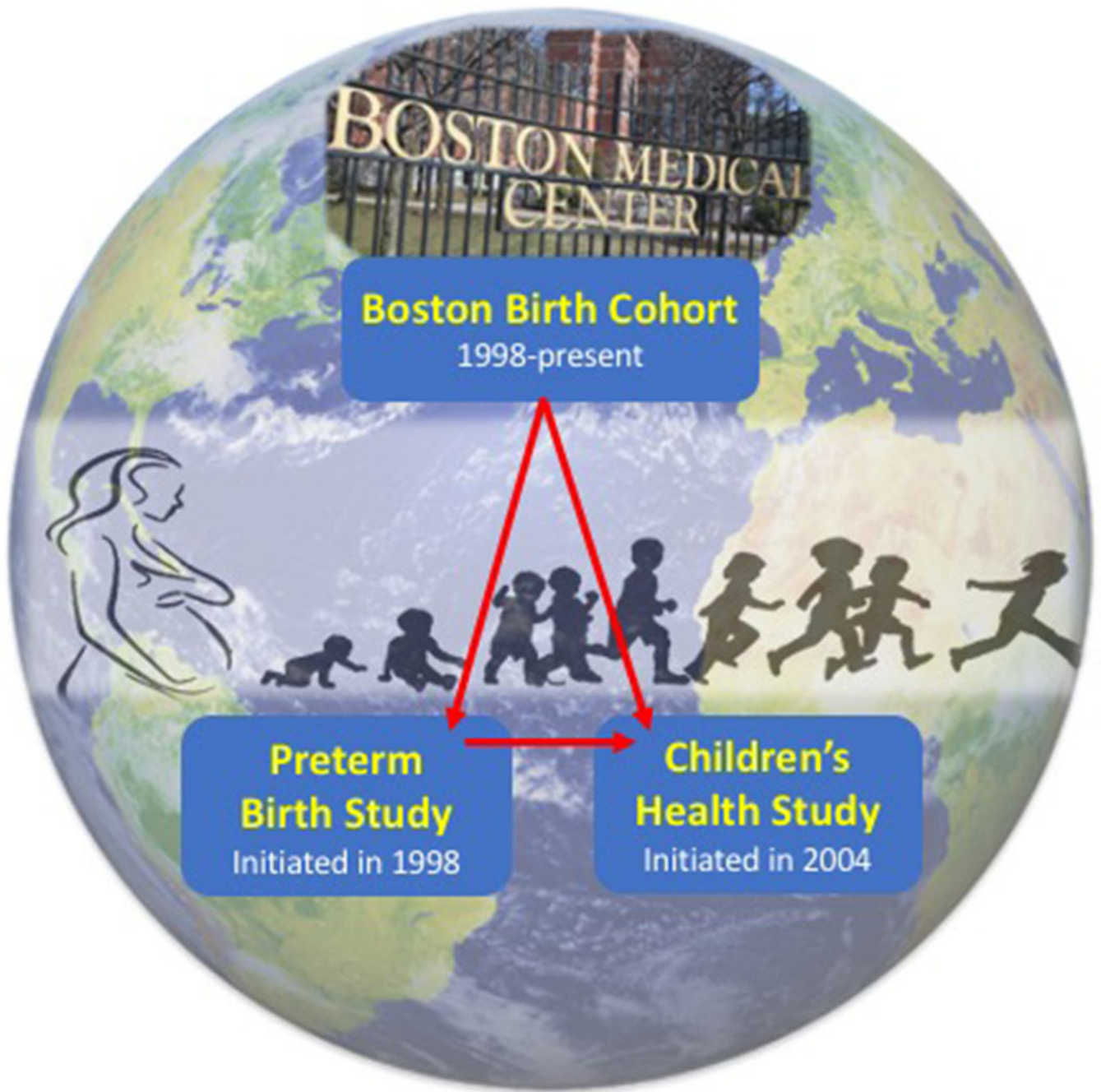
Figure 2. Illustration of the Boston Birth Cohort with two linked IRB approved protocols at the Boston Medical Center.