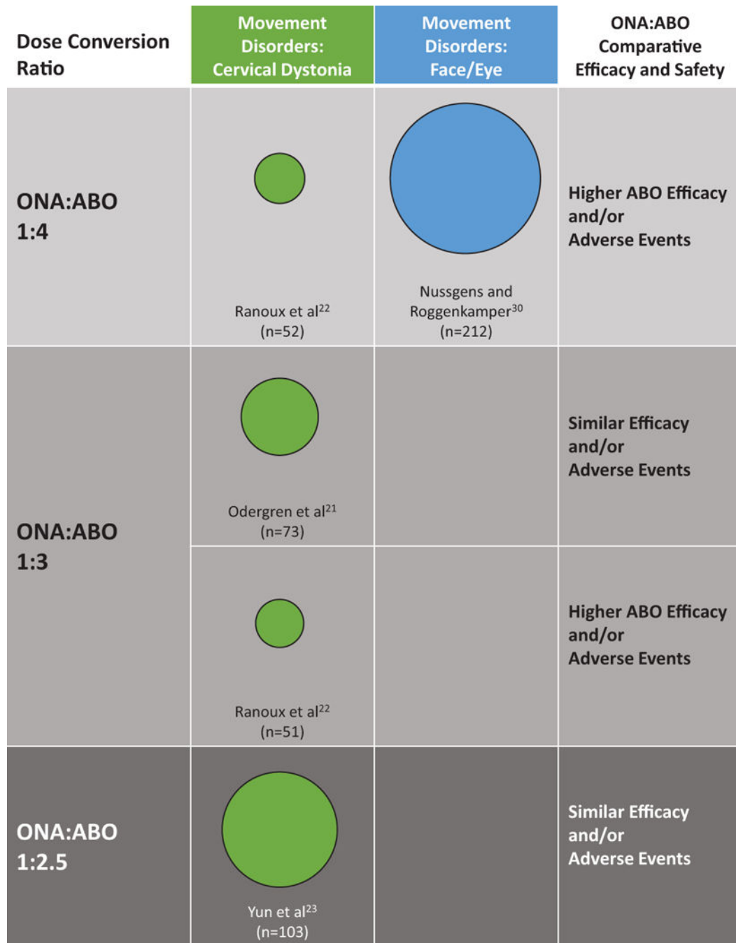
Figure 2. Distribution of studies by indication, dose conversion ratio, and outcomes. Note: the sizes of the circles reflect number of subjects in each study.