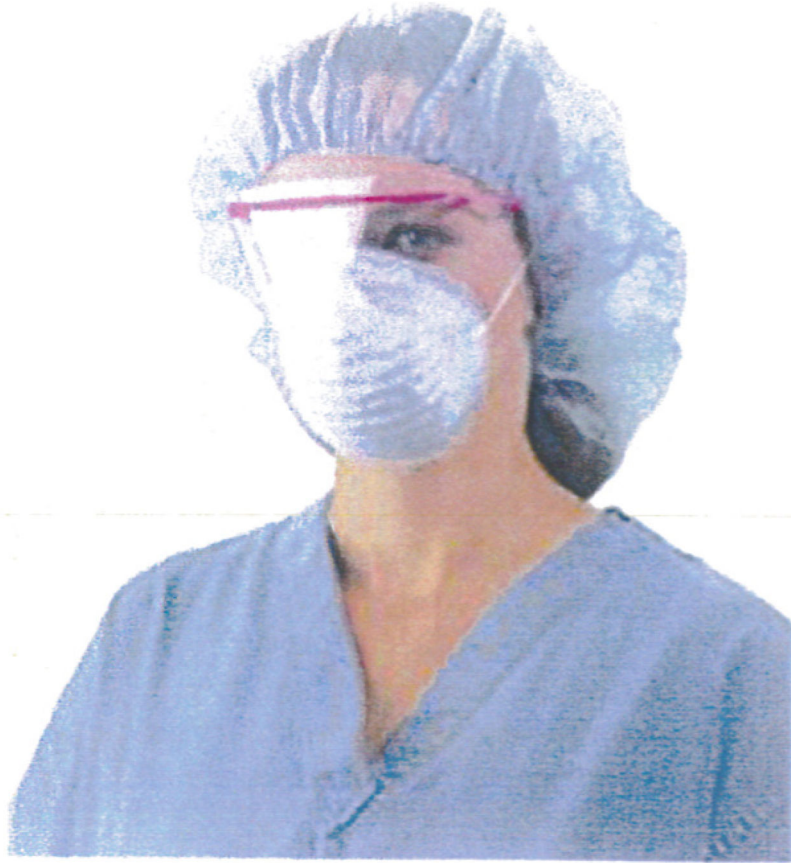
Figure 1. Half face piece face shield with eyewear-like temple bars.