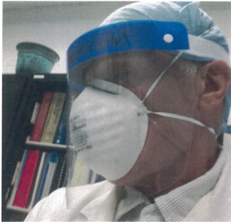
Figure 3. Disposable one-piece face/neck length face shield visor assembly with foam forehead cushion and elastic strap.