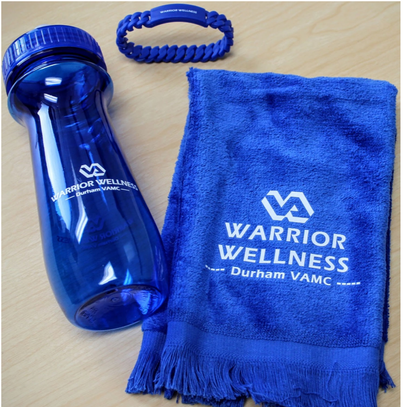
Figure 2. Warrior Wellness Branding Materials